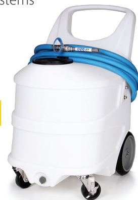
30-gal Rolling Foamer AF08FI-30N