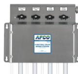
4-way Mixing Station AF08985400