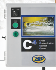
C4 Doorway Foamer W59901