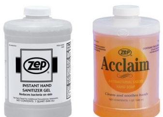
P# 87832 P# 314901