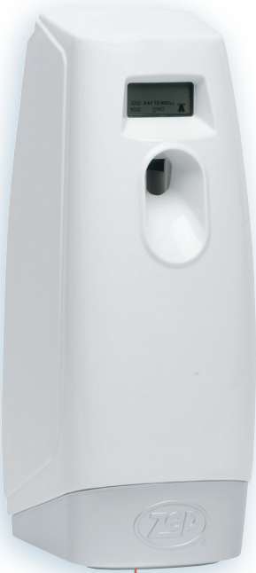
3000 Ultra Plus Prod. #6897

Both dispensers provide dependable automatic dispensing that continuously protects your environment against unpleasant odors.